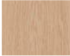
WLO Lofty Oak