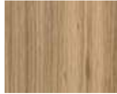
WFO Fawn Cypress