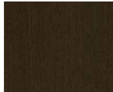
WBW Henna Walnut