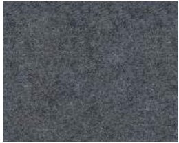
Nimbus Gray 141