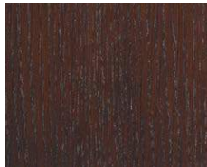
WMO Mocha Oak