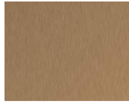
Satin Bronze MFSB