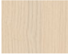
WAF Narvik Ash