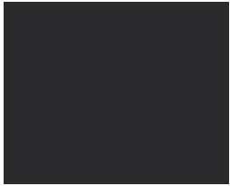
Matte Black MFMB