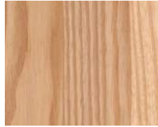
WCA Natural Ash