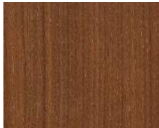
WGW Gunstock Walnut