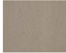
WWW Weathered Walnut