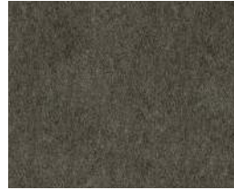
Autumn Gray 143