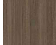
TSTV Studio Teak