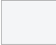
WWP Designer White