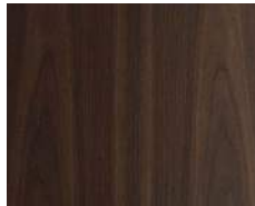
WSW Smokey Walnut