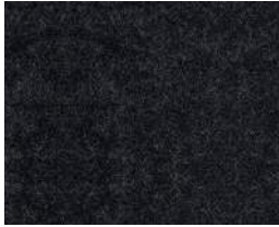
Canyon Black 142